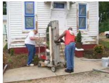
The men tape windows and youth scrap away the old paint in preparation for power washing.