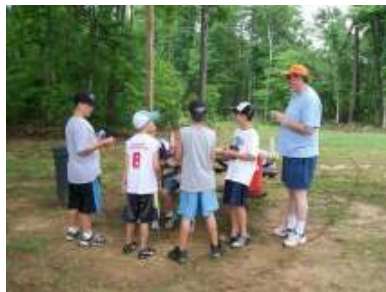
Webb's Chapel youth receive instructions in preparation for caulking the church.

~Reverend Eric Reece, pastor of Webb's Chapel UMC~