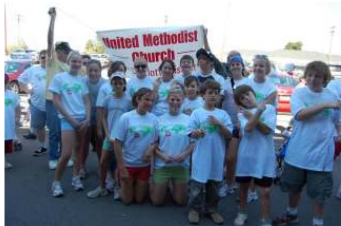
United Methodist youth walk to help eliminate hunger at the October 14th Crop Walk.