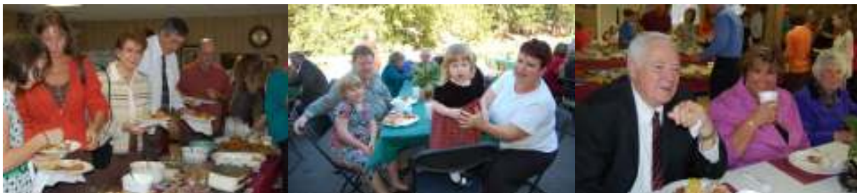
Festivities surrounding Homecoming at Calvary UMC on October 14th.