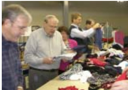
Concentrating on folding