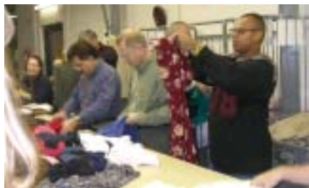
I think this is right!