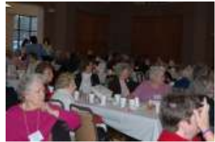
Great attendance !