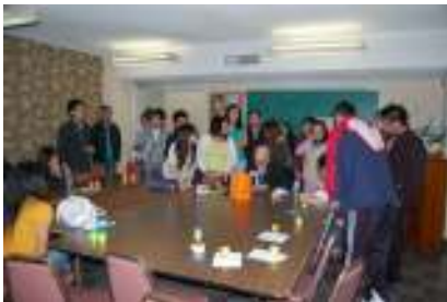
Eager youth learn from an authority on John Wesley.