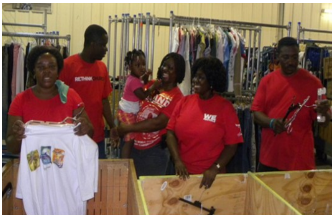
Sorting clothes at Crisis Assistance Ministry.