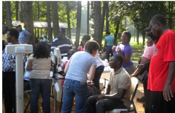
Community Health Screening