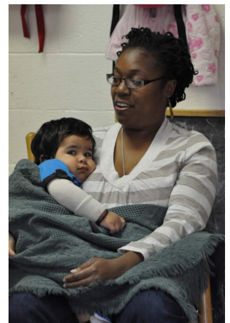
Staff provide nurturing care to the children.