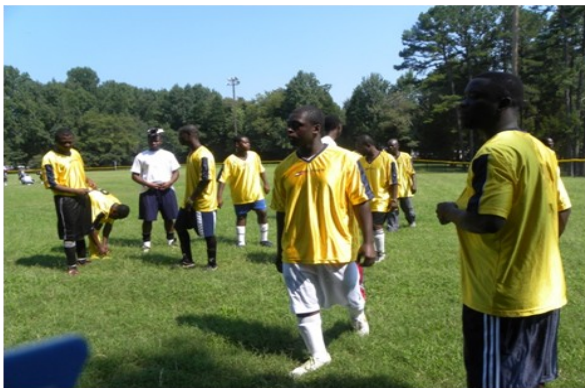
Community Keep Fit

One thing that will always remain the same at Ghana Mission is our deep passion and focus on God's Word and Community. This is what we do; this is what we live for! May God's name be praised and honored forever- Amen!