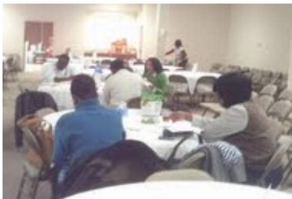
Bridges Out of Poverty training at Sanctuary UMC.