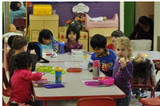
The richness of diversity at St. Andrew's Preschool.