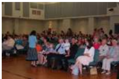
A full house was gathered.

HUMC's new facility is located at 14005 Stumptown Road in Huntersville, approximately two miles north of the former church. Plans for the church's relocation began ten (10) years ago at the request of the Charlotte District to place a "regional" church in the Huntersville area. Sitting on the 30 acre site is a new 38,000-square foot facility which contains a worship center/multi-use area, preschool and youth wings, children's and adult education space, staff offices, and production suite. To accommodate three of the church's on-going ministries—Room in the Inn, Salkehatchie (a youth home-repair mission), and the community food pantry—shower stalls and a larger food storage space were included in the design.