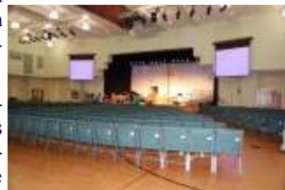
Worship Center/multi-purpose room.