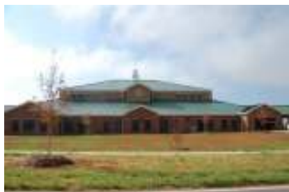
Huntersville UMC new facility.