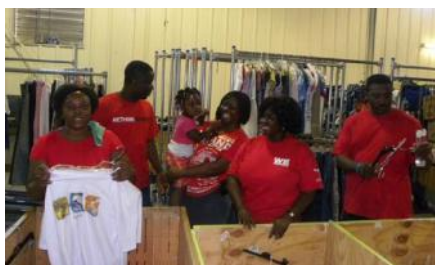
The sorting of clothes at "Crisis Assistance Ministry".