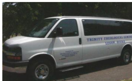
Ghana Mission donated a van to Trinity Theological Seminary in Ghana, West Africa. It is used for transporting pastors to remote areas.