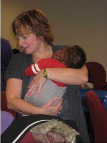
Light of Christ Embraces Care Ring Mothers and Children at Christmas.