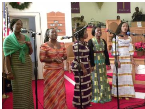
The ministration of song during Advent service.

We also offer opportunities for friendship to develop through small groups such as practical contemporary Bible Study, prayer groups, music groups, electrified and inspired worship services . One thing that will always remain the same at Ghana Mission is our deep passion and focus on God's Word and Community. This is what we do; this is what we live for! May God's name be praised and honored forever- Amen!