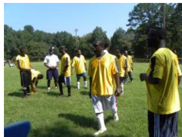
"Community Keep Fit" in action.