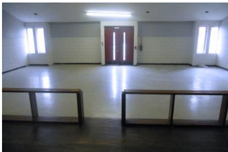
The chapel is painted and will be used for workshops/activities.