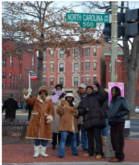
A group of South Tryon Community UMC members dressed for the 17 degree temperature crossing North Carolina Avenue at Pennsylvania Avenue on their way to the Capitol Mall already crowded with about 2 million visitors.