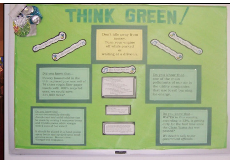
UM Women District Annual Meeting theme reflected upon environmental education "Live Green-Stay Green". The event was held at Simpson-Gillespie UMC on August 23, 2008.