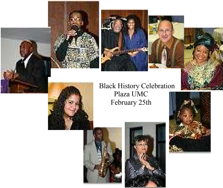
Black History Celebration Plaza UMC February 25th