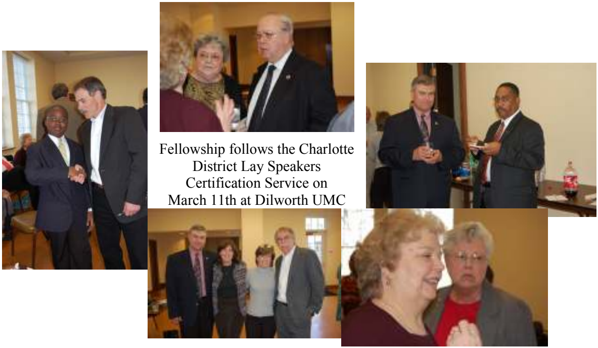
Fellowship follows the Charlotte District Lay Speakers Certification Service on March 11th at Dilworth UMC